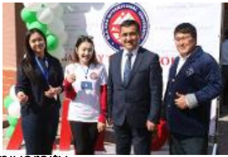
International Ala-Too University

This is the one of the strongest universities in Kyrgyzstan. There are 4 faculties 3